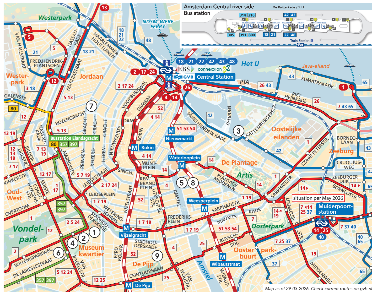
Map as of 29-03-2026. Check current routes on gvb.nl

Metro 52, also known as the North-South line, is an attraction in itself. The metro takes you in only 16 minutes from Station Noord, via the city centre to Station Zuid. At each metro station you can find an art project. Get off at station Vijzelgracht for the Museum Quarter and at Europaplein for the RAI Conference Centre.